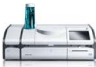
Cedex Bio Analyzer