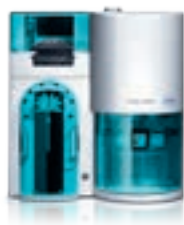
Cedex HiRes Analyzer