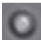
Accuracy in cell analysis with high-resolution imaging

Figure 1: Image of living cell (Cedex HiRes Analyzer image).