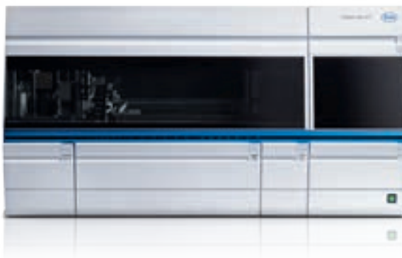
Cedex Bio HT Analyzer